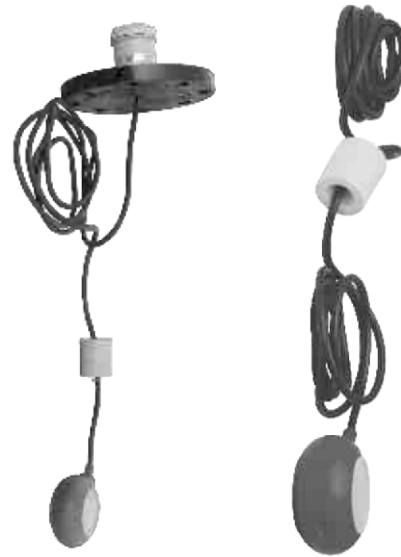
Cable Float Level Switch, ANI42-2